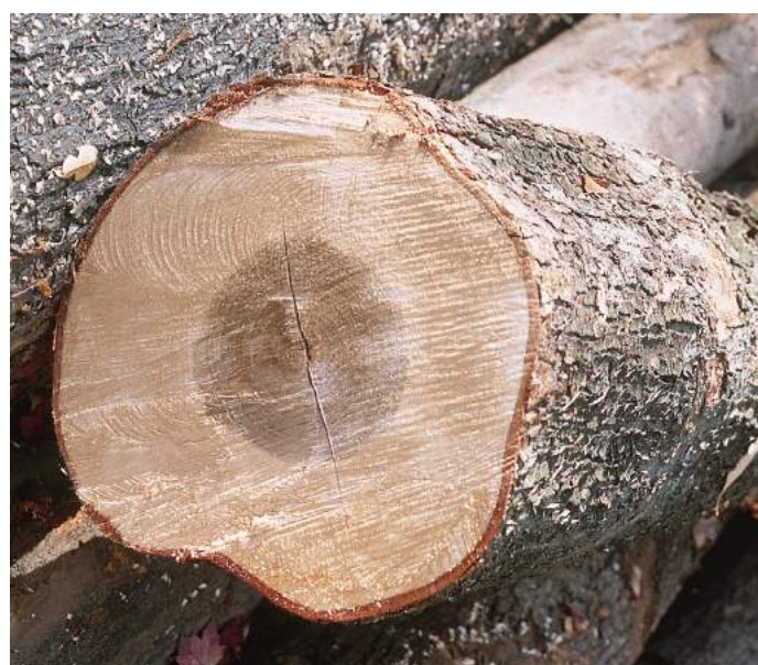
AHEC highlights the value of a "risk-based" approach

AHEC has consistently highlighted the value of a "risk-based" approach to provision of assurances of legal and sustainable timber sourcing, particularly when dealing with products from non-industrial forest owners or composite products for which it is not possible to trace fibre back to specific forest management units.