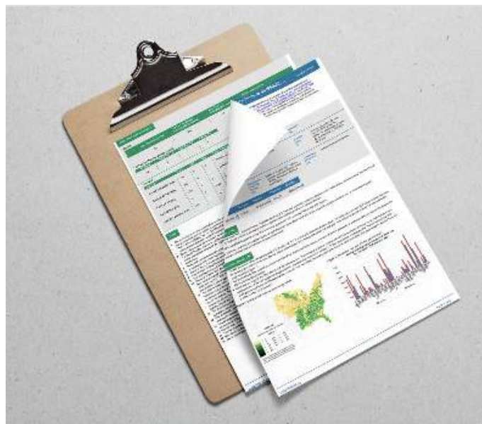
The AHEP system provide AHEC members with species-specific data

reported for EUTR and similar regulations, alongside sustainability data from the FIA, the LCA and the Seneca Creek Assessment, to their overseas customers. AHEPs can be issued by AHEC members either for the term of an individual supply contract or for individual consignments of U.S. hardwood exported by AHEC Members to anywhere in the world.