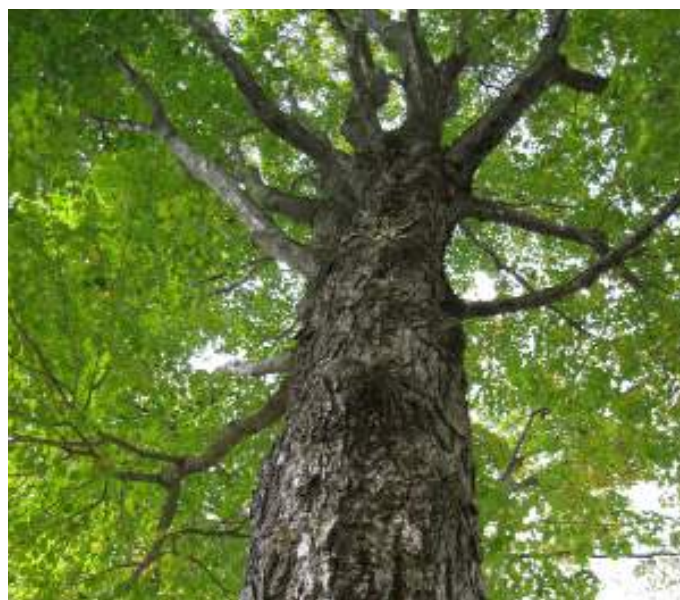
AHEC's updated Seneca Creek study aims to facilitate U.S. hardwoods' continuing market access

AHEC has subsequently used this data to inform LCAs of finished products and structures containing U.S. hardwoods regularly undertaken for AHEC demonstration projects. The AHEC website hosts an LCA tool providing easy access to environmental impact data on selected American hardwood species and thickness to the overseas customer using the specified transport route.