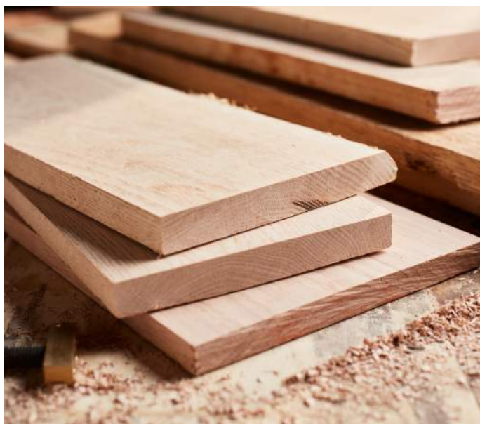
Systems like FSC easy to manipulate as they rely on annual paper-based audits