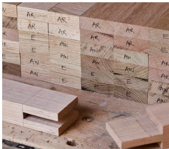
All data used for AHEC's online tools were drawn from verifiable resources

The LCA study of the cradle-to-gate environmental impacts of delivering U.S. hardwood lumber and veneer into export markets was prepared by Thinkstep (formerly PE International) in 2012 in compliance with the ISO 14040/44 standards for LCA. Thinkstep is a global leader in Sustainability Performance Management and provides the world's largest and most accurate sustainability databases.